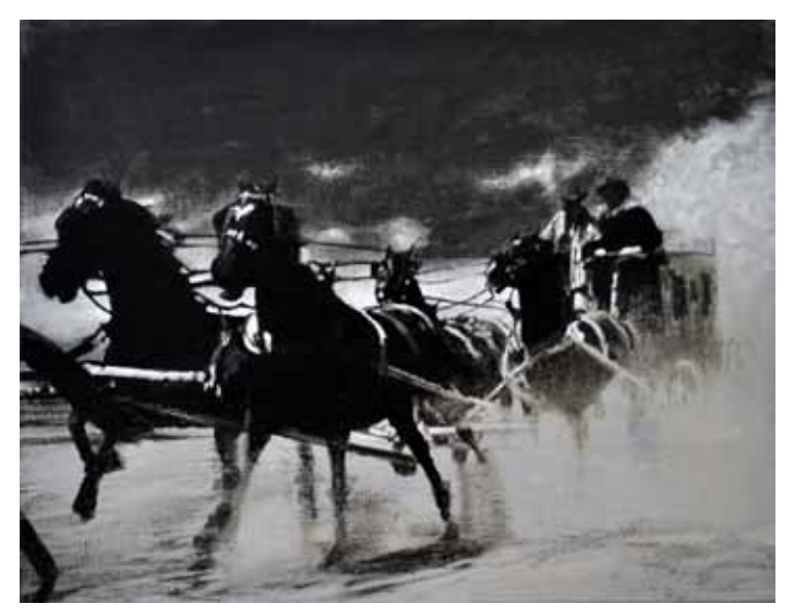
Bullion Stage, 2012, acrylic on canvas panel, 14 x 18 inches

The American West as a topic, or as a subject swept up by the popular imagination, has run a long course and it has not run out. It is still being explored, deconstructed and reconstructed. The momentum