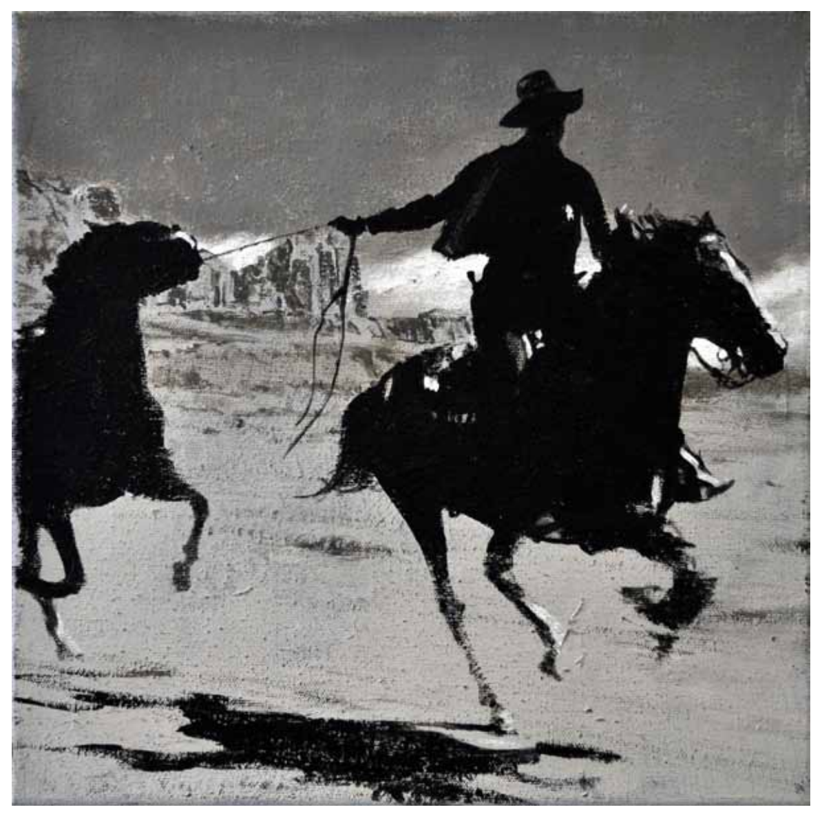
Steady Rider, 2012, acrylic on canvas, 12 x 12 inches